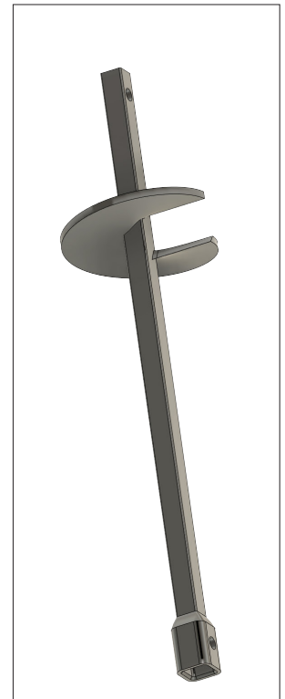
The HGA Extension has standard straight flight finish.

Contact SureBuilt Engineering for assistance.