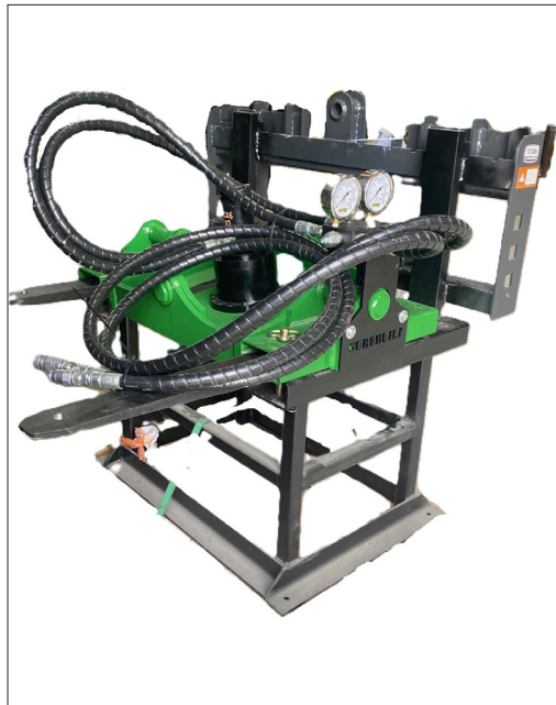
SureBuilt Drive Heads available for sale or rent.

* 3/4" Grade 8 Bolt for connection to HGA