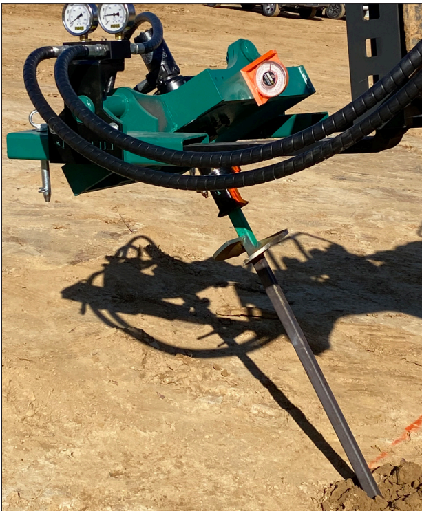
A skidsteer with a torque motor attachment is used to install the Helical Ground Anchor at the prescribed angle and depth for bracing.